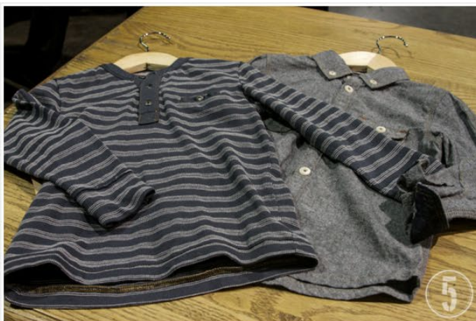
Children's clothing from Jeremiah - because your future kids need to look good for Instagram.