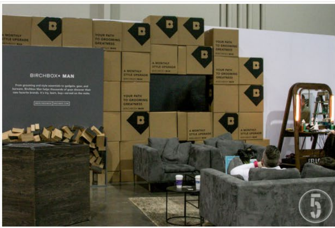
Birchbox is a monthly delivery service of grooming products, packed in small sample sizes for testing.