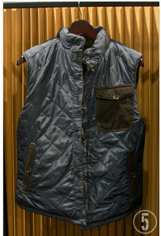
One of our favorite brands from the show, Singer + Sargent, mixes tried and true menswear with a modern edge.