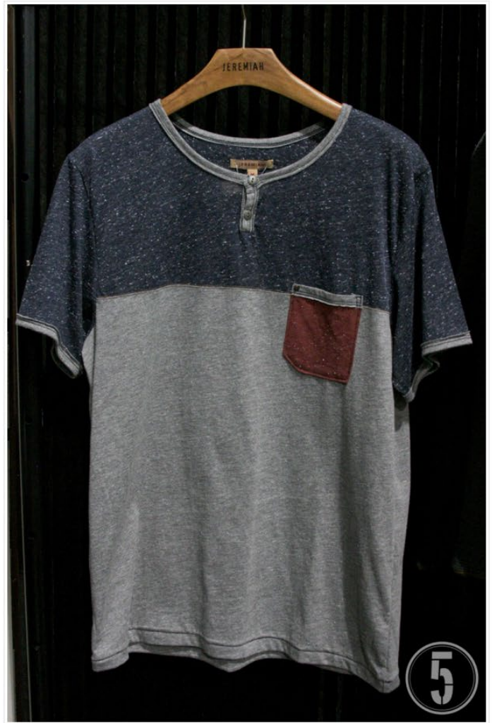
Jeremiah clothing is classic, effortless and can enhance your everyday fit with its timeless essentials and silhouettes.